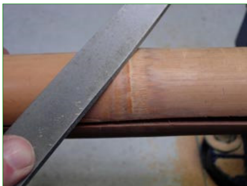
Filing the nodes before splitting is optional.