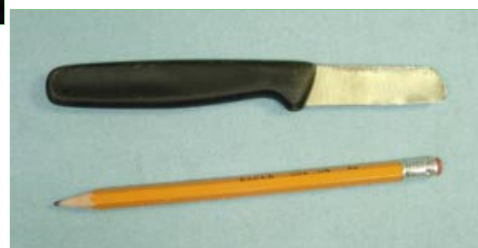
The splitting tool is an ordinary kitchen paring knife with a rounded tip for safety. The thin blade keeps the split travel to a minimum ensuring maximum control over the work.