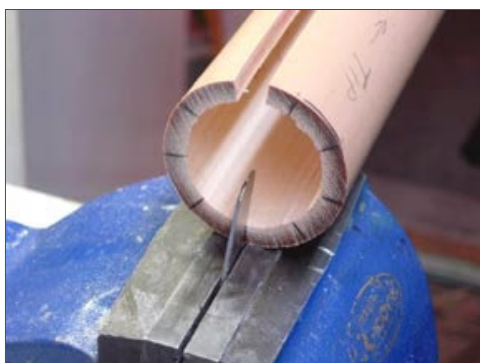
In your workbench vise, grip the paring knife leaving about one inch of the blade exposed. Against the sharp edge of the knife blade, align the mark between the two groups of four that come nearest to halving the culm, and sharply rap the far end to start the split. Push the culm to split it into two pieces, then clean out the inside of the node dams. All splitting is done with the knife in the vise allowing you to use the strong muscles of your legs, back and arms.