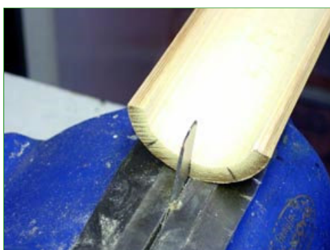
Splitting into groups. At these early stages, the split should follow the grain.