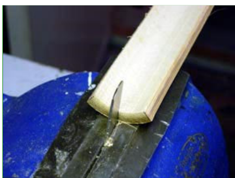
Split each section into single groups of four.